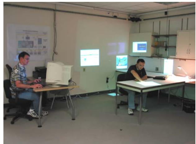
Figure 2. An overview of the experimental setup (prior to installing the “round table”). The “wizard” is seated at his control station on the left, and a researcher is playing the role of a participant on the right. Note the projected images on the wall, desk, and floor surfaces.

We performed the user study in one corner of a dedicated projection lab (see Figures 1 and 2). We placed several pieces of furniture in our simulated office space to resemble a typical individual office layout. The researcher guiding the participant through the study was seated at a video recording and system monitoring system across the desk from the participant. The “wizard” sat behind the participant as a monitor, which displayed multiple live camera views of the simulated office. (This perspective, together with the “wizard’s” knowledge of the participants’ intentions, enabled the “wizard” to evoke convincing feedback in response to their interactions. In debriefing, 5 of 9 participants reported that they believed the system was a fully-functional implementation.) Participants were led to believe that the “wizard’s” presence was necessary to provide